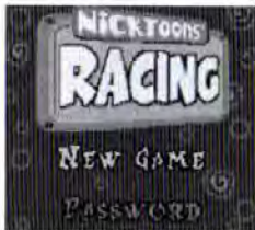
Main Option Screen