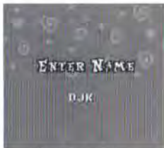
Name Entry Screen

If more than one player is racing, this procedure will need to be repeated for each additional player.