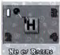
Player Selection Screen