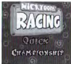
Game Option Screen

In Championship Mode, you must compete on each track in each of the four Program Environments in a specific order.